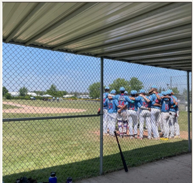
18U AAA at the Cap Classic Buffalo