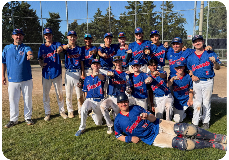
18U A post win in Mississauga July 20th

Congratulations to the entire team on an exceptional tournament!